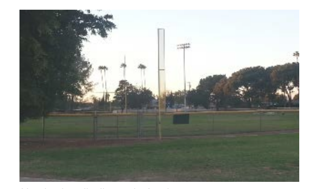
Need to install tall security fencing.