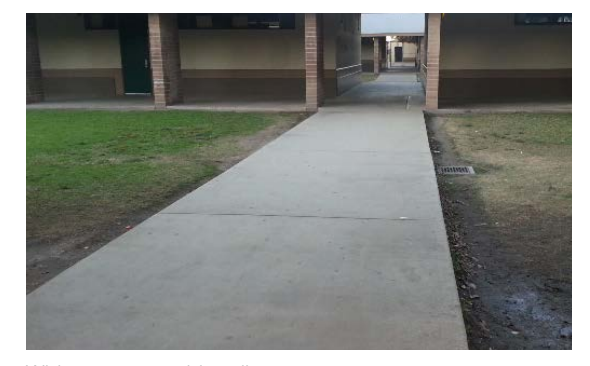
Widen concrete sidewalks.