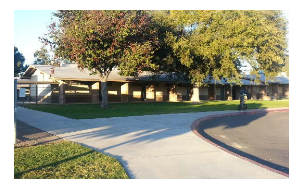
Need to reconfigure campus entry/exit.