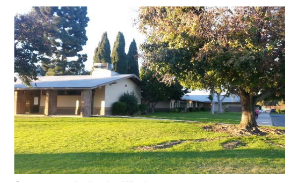
Campus wayfinding is difficult.