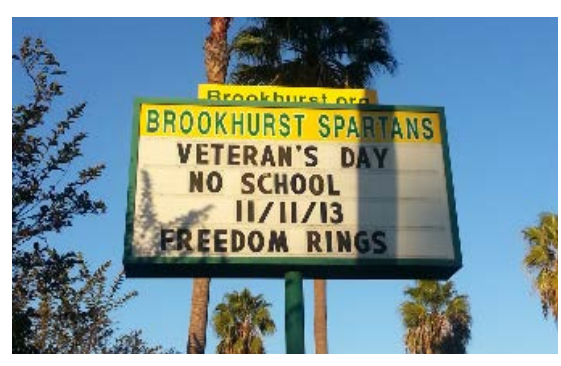
Upgrade campus marquee to digital format.