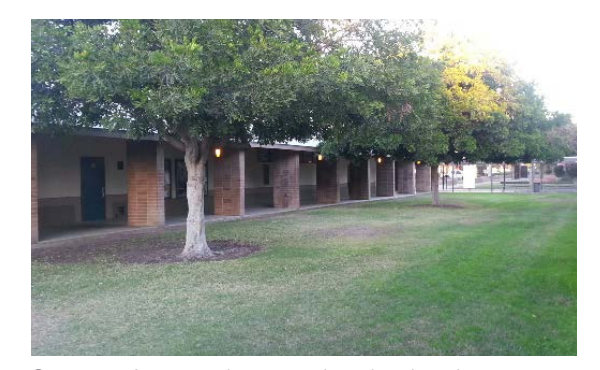
Convert turf courtyards to paved outdoor learning areas.