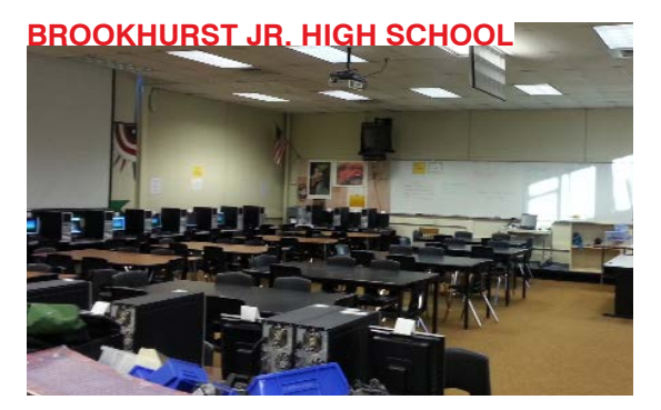
Need additional science, STEM and computer labs.