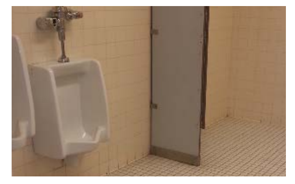
More restrooms needed on campus.

ANAHEIM UNION HIGH SCHOOL DISTRICT Facilities Master Plan